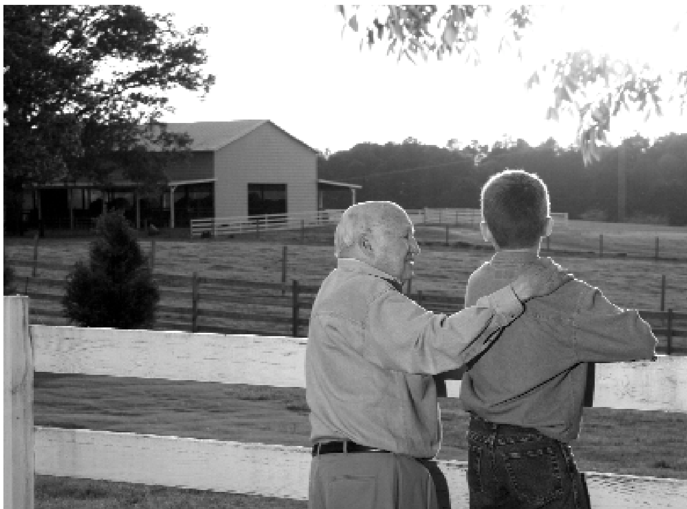
“Not many men can claim that more than 150 children call them ‘Grandpa.’ It’s my proudest distinction,” says Cathy.

Today, the foundation runs a dozen WinShape Homes, each of which is operated by a husband-and-wife team. The goal is “to provide a loving, nurturing home to those children