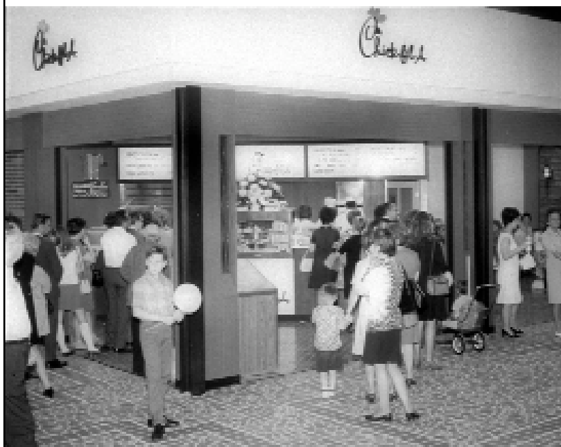
Chick-fil-A opened its first restaurant in Atlanta's Greenbriar Shopping Center in 1967. Its second restaurant, pictured above, opened in Savannah.

something other than getting out the next short-order meal. "My life is made of taking advantage of unexpected opportunities," he says. This was one of them. He had noticed the growing popularity of McDonald's and other fast-food restaurants, where customers placed orders at the counter and cleared their own tables. He decided to change the way he was doing business.