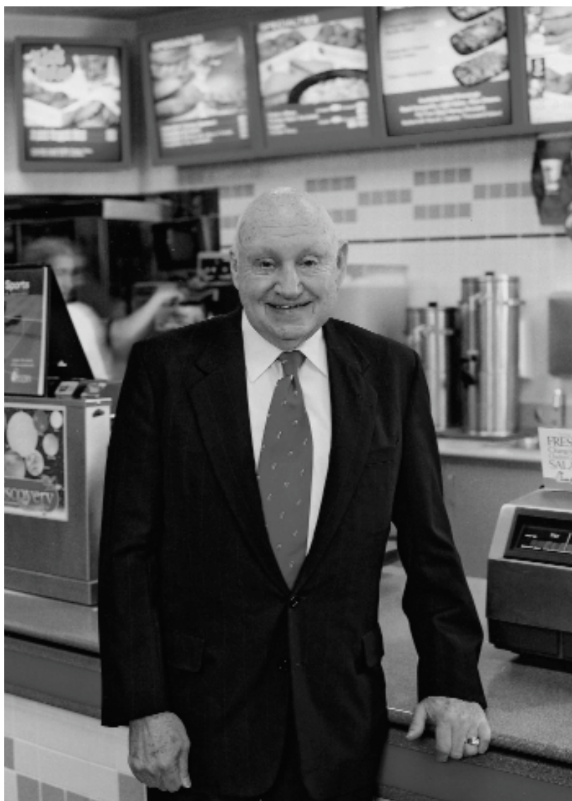
Chick-fil-A has seen 40 consecutive years of annual sales increases, including double-digit increases for each of the last 14 years.