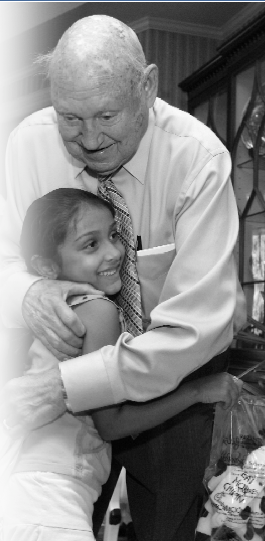
Truett Cathy gets a hug from a visiting schoolchild during a tour of Chick-fil-A's corporate headquarters in July 2006.

THE STORY OF CATHY'S REMARKABLE ASCENT from rural Georgia to the "Moral Tycoon" (as a newspaper once dubbed him) began in Eatonton, Georgia, a small town about halfway between Atlanta and Augusta. There's something poetic about a restaurant magnate coming from a place called Eatonton, but Cathy spent only the first three years of his life there and barely remembers the place. His family was religious, and Cathy's unusual middle name—Truett, as his friends call him—comes from a popular Baptist preacher named George W. Truett (1867-1944). Times were tough even before the Great Depression, and Cathy's father went broke as a real-estate investor. The family moved to Atlanta so he could sell insurance. He was not very good at it. To help pay the bills, Cathy's mother took in boarders.